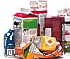
Food & Beverage Cartons