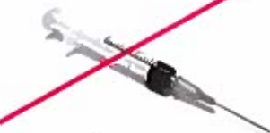
NO Needles (Keep medical waste out of recycling. Place in safe disposal containers like Waste Management's MedWaste Tracker® box.)

To Learn More Visit: RecycleOftenRecycleRight.com