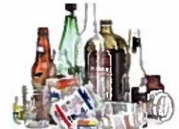
Glass Bottles & Containers

Do NOT include in your mixed recycling cart: