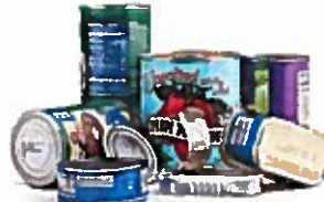
Food & Beverage Cans