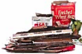
Flattened Cardboard & Paperboard